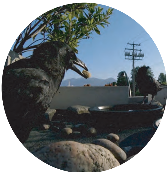
Figure 8 (top)

Detail, Tales from the Bird Park J. Andreyev, film compilation 29:27 mins, HD video, 2023