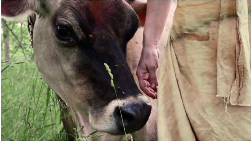
Figure 4 – Itchy in the Grass , film still, Ruth K. Burke, 2018