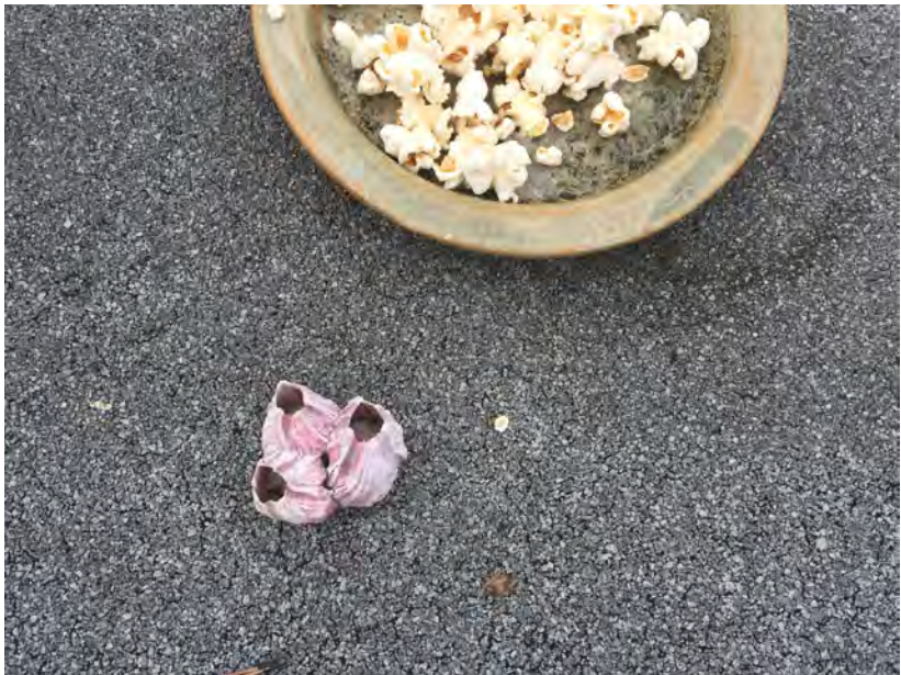
Figure 3 – detail from Bird Park Survival Station Popcorn gifted to crows by the artist is reciprocated in their gift of a barnacle. Julie Andreyev, digital print, 2023