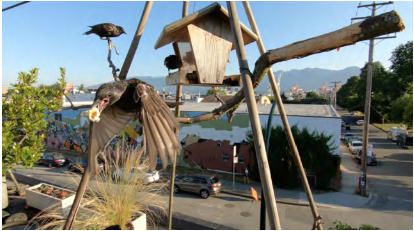
Figure 2 – film still, Tales from the Bird Park, a film compilation of selected webcam footage from Julie Andreyev's Bird Park Survival Station. 29:27 mins, HD video, 2023