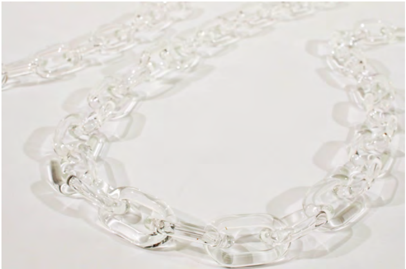
Figure 6 (top) – Lick Map, Ruth K. Burke, Detail of photographic print, 37" x 36", 2024 Figure 7 (bottom) – Line of Draft, Ruth K. Burke, Annealed glass chain, 2022