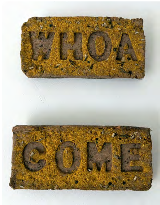
Figure 5 – Seed Tiles, a component of the Domestic Rewilding earthworks project, Ruth K. Burke, 2024